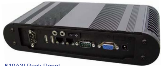
510A3I Back Panel