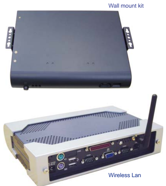
Wall mount kit